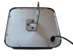
HPOL with Uptilt