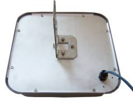
HPOL with Downtilt