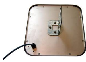
VPOL with Uptilt