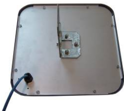
VPOL with Downtilt