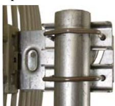
2 u-bolts and clamps 24dB Antenna ONLY