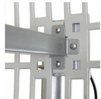
Attach extension tube